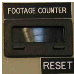
Tape Change Footage Counter