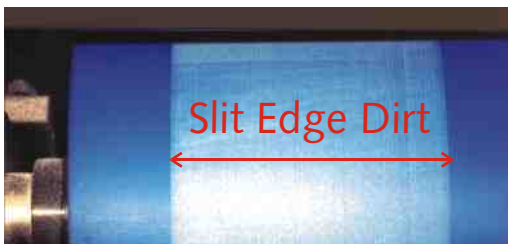
Cleaning Results from Oscillation